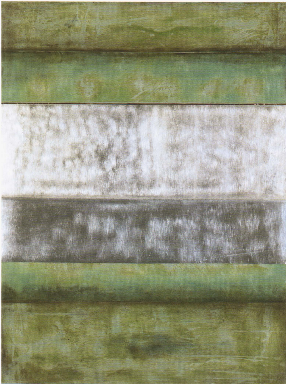
Green encaustic with aluminium and silver leaf on wood 112 x 85 cm