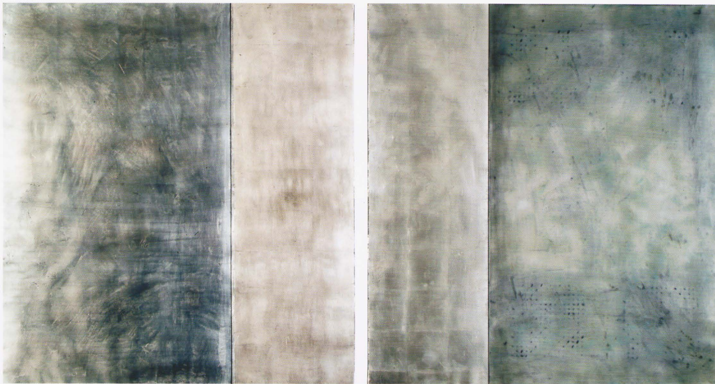
Silver diptych encaustic with aluminium and silver leaf on wood each piece 87 x 82 cm