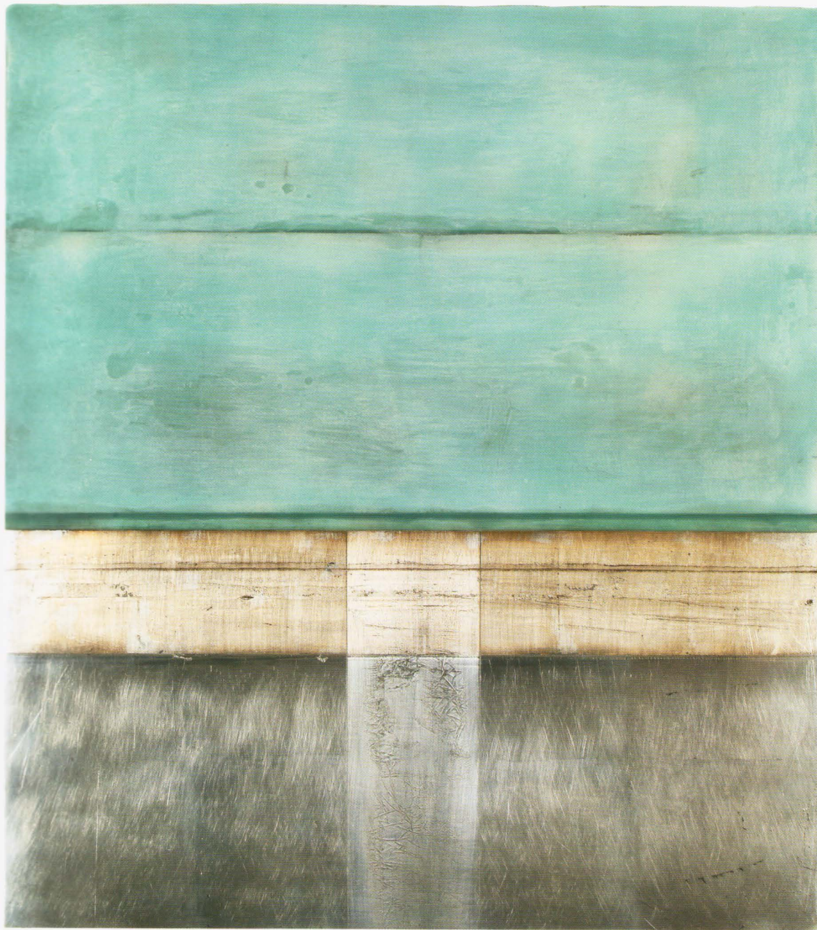
Pale grey encaustic with aluminium and silver leaf on wood 64 x 57 cm